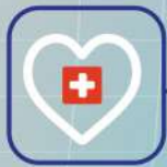
TABLE TOP VIRUS SHIELD

PREVENT DIRECT TRANSMISSION OF VIRUS BETWEEN STAFF & CUSTOMER